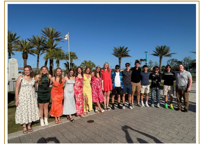
2025 Senior Trip

Address: 800 Hwy 131, Wellington, MO 64097 Phone: 816-240-2621 | FAX: 816-857-7030