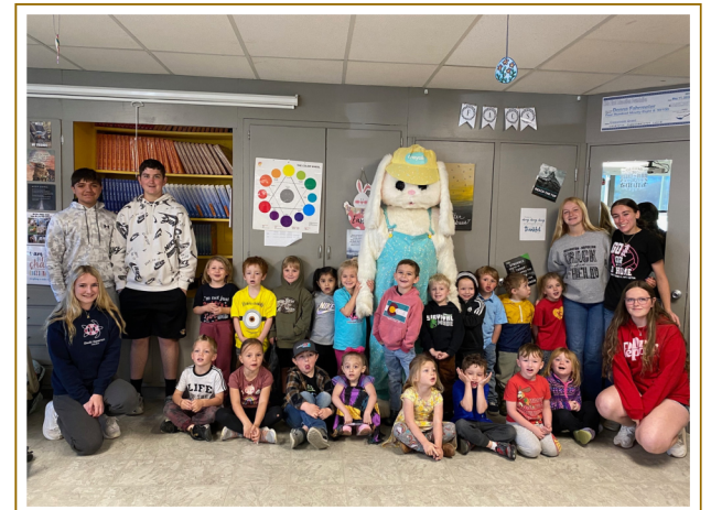
Child Development / Pre-K